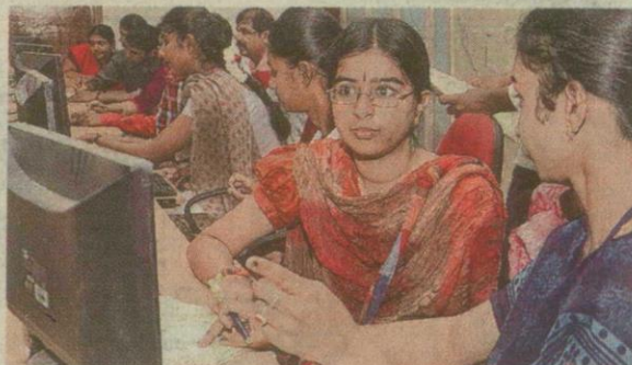
Uncertain fate: Students attend counselling for an MBA course at the Government College of Technology in Coimbatore in this file photo.

Deans and chairmen of B-schools offering post-graduate diploma in management (PGDM), described the December 23 University Grants Commission (UGC) proposal as retrograde, similar to the December 2010 notification issued by All India Council for Technical Education (AICTE), which was suspended by the Supreme Court.