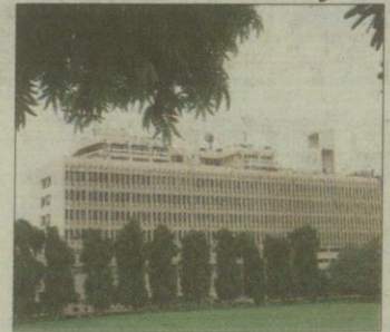
■ Indian Institute of Technology, Delhi